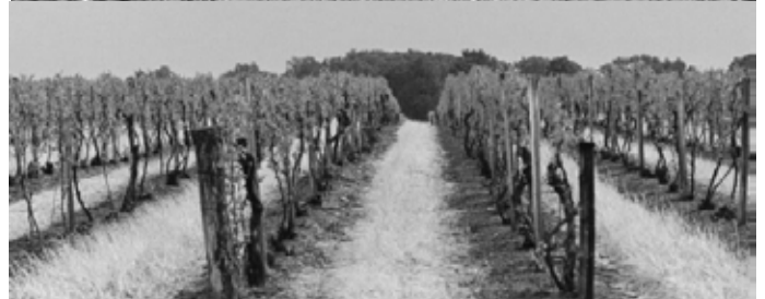
Vineyard floor management (top to bottom): permanent sod, straw mulch, seeded row middle, and killed sod in row middle.