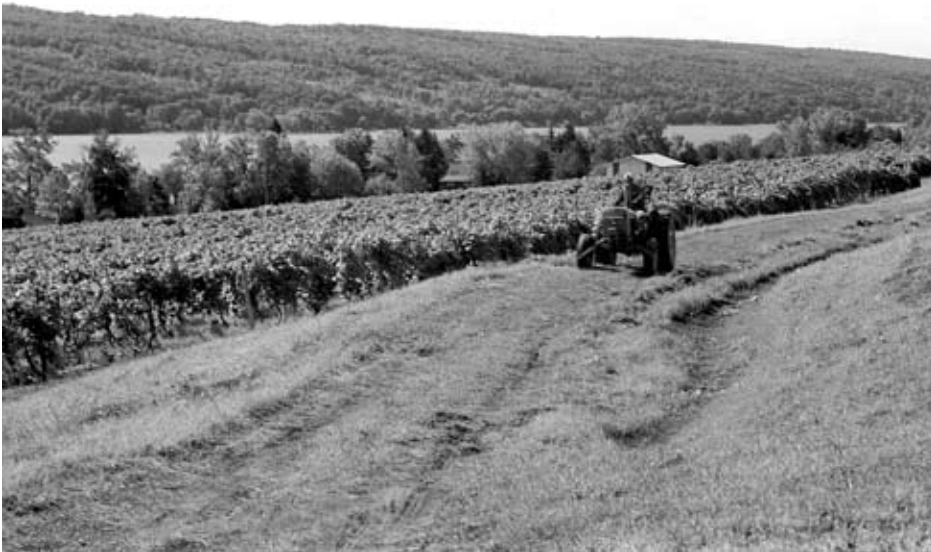
Diversion ditches channel excess water around vineyards, reducing potential runoff and erosion.