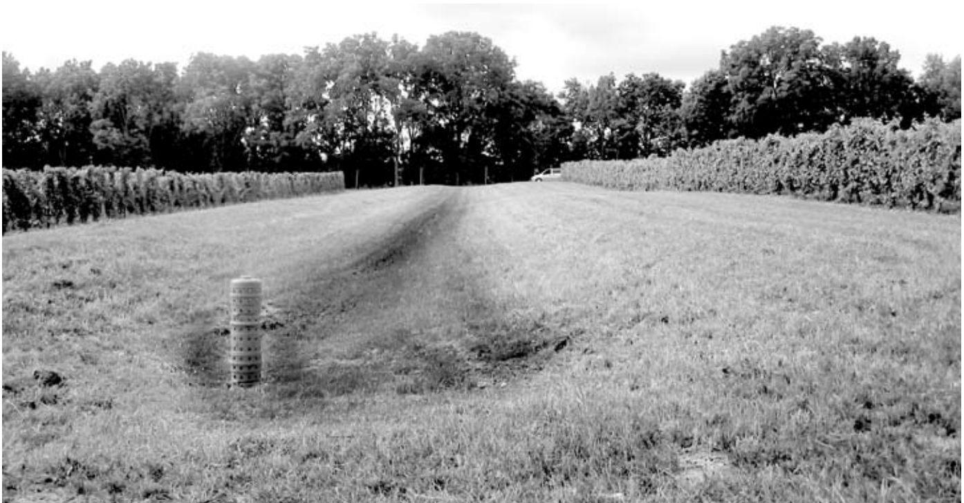
Diversion ditches separating two young vineyard blocks. Note standpipe in foreground.