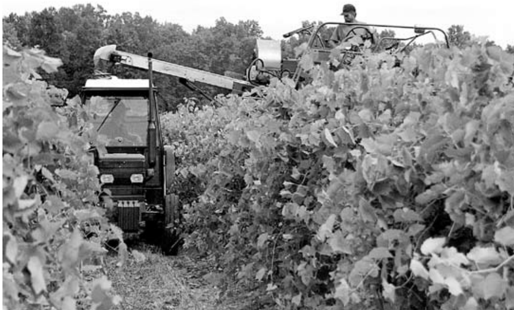
Using soil conservation practices helps maintain productive vineyards.