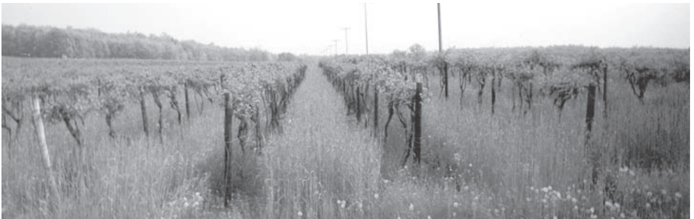
Cereal rye seeded in row middles protects soil from the force of raindrops hitting bare soil.

Soil conservation practices prevent erosion and maintain clean water in three ways. First, diversion of water around vineyards keeps water clean, because it doesn’t wash over disturbed soil in the first place. Filtering of water through soil (drainage systems) and ground cov-