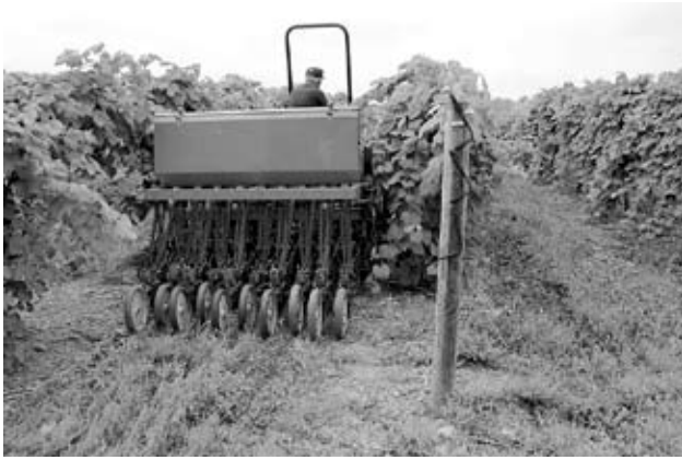
This No-till seeder plants cover crops without the need for additional soil protection, maintaining protective stubble on the surface while the cover crop germinates.

Using cover crops and mulches to protect the soil surface has an enormous effect on annual rates of erosion. Mulches reduce the force of rainfall hitting the soil by 98%, according to Jim Balyczek, Yates County Soil Conservation District Manager. Use of permanent cover crops in row middles on a 10% slope with 200 ft slope length reduced potential annual erosion from 5.1 T/acre under ‘clean tillage’ to 0.39 T/acre, in an example provided by Tibor Horvath, NYS Conservation Agronomist, USDA Natural Resources Conservation Service.